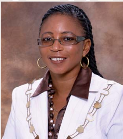
Mayor LA Koloji

The //Khara Hais Municipality are currently running 3 sampling on drinking water, in order to ensure compliance on drinking water standards to SANS 241: